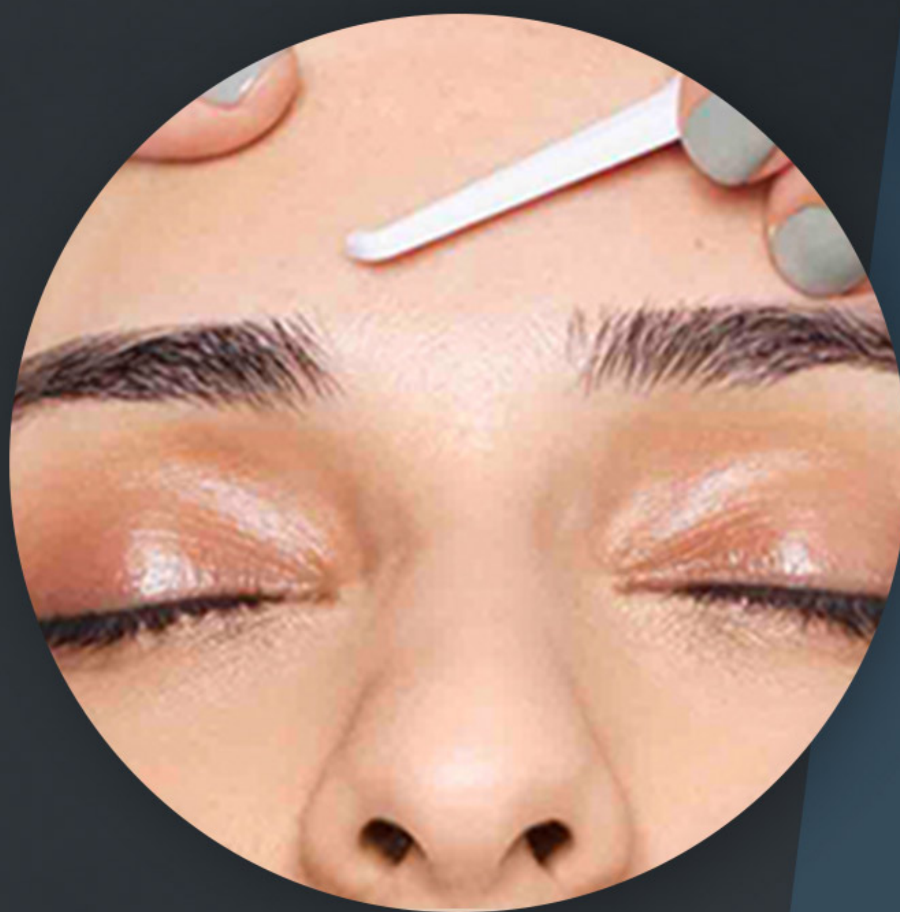
DERMA PLANNING WORKSHOP