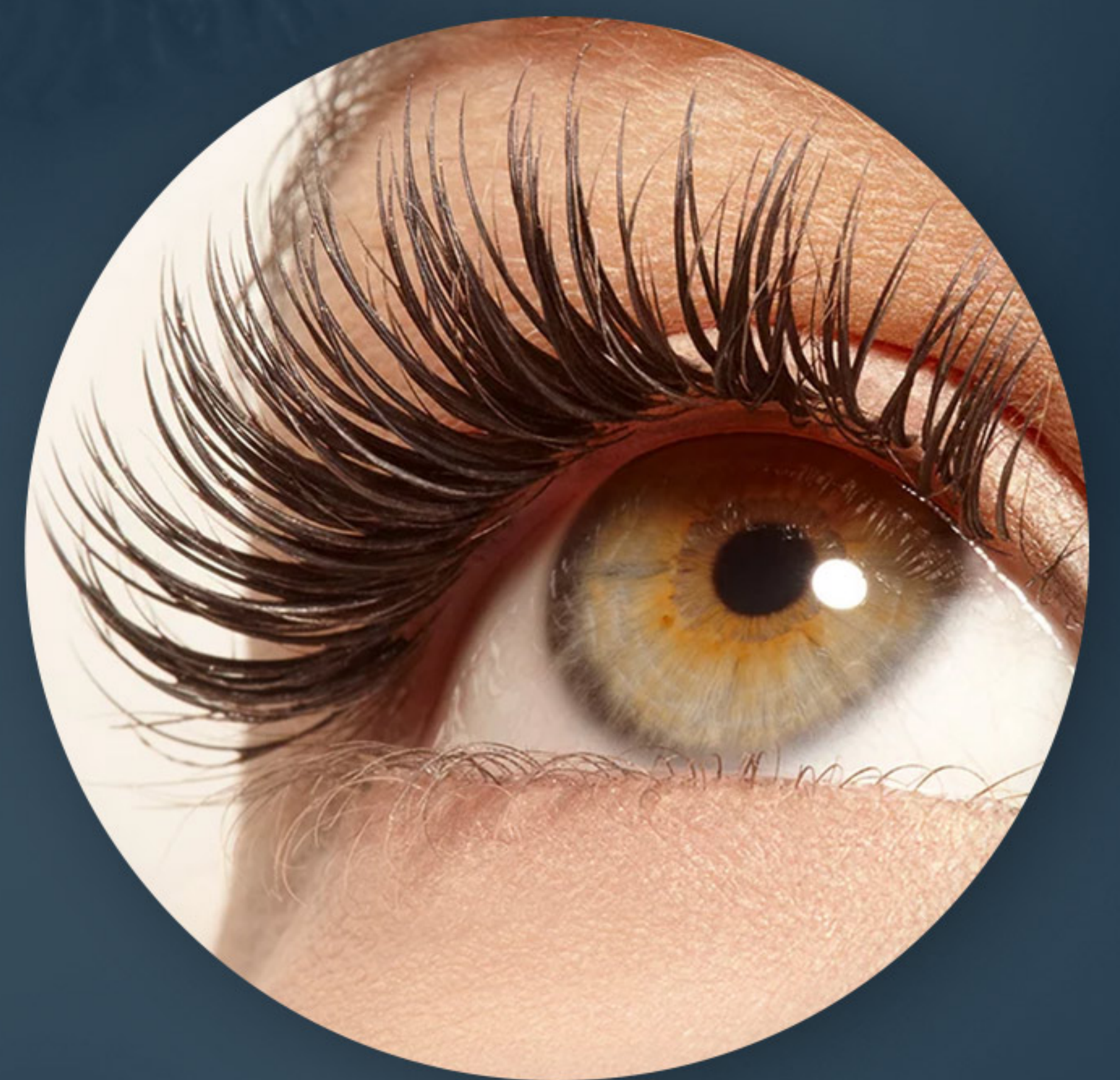
LASH LIFT WORKSHOP