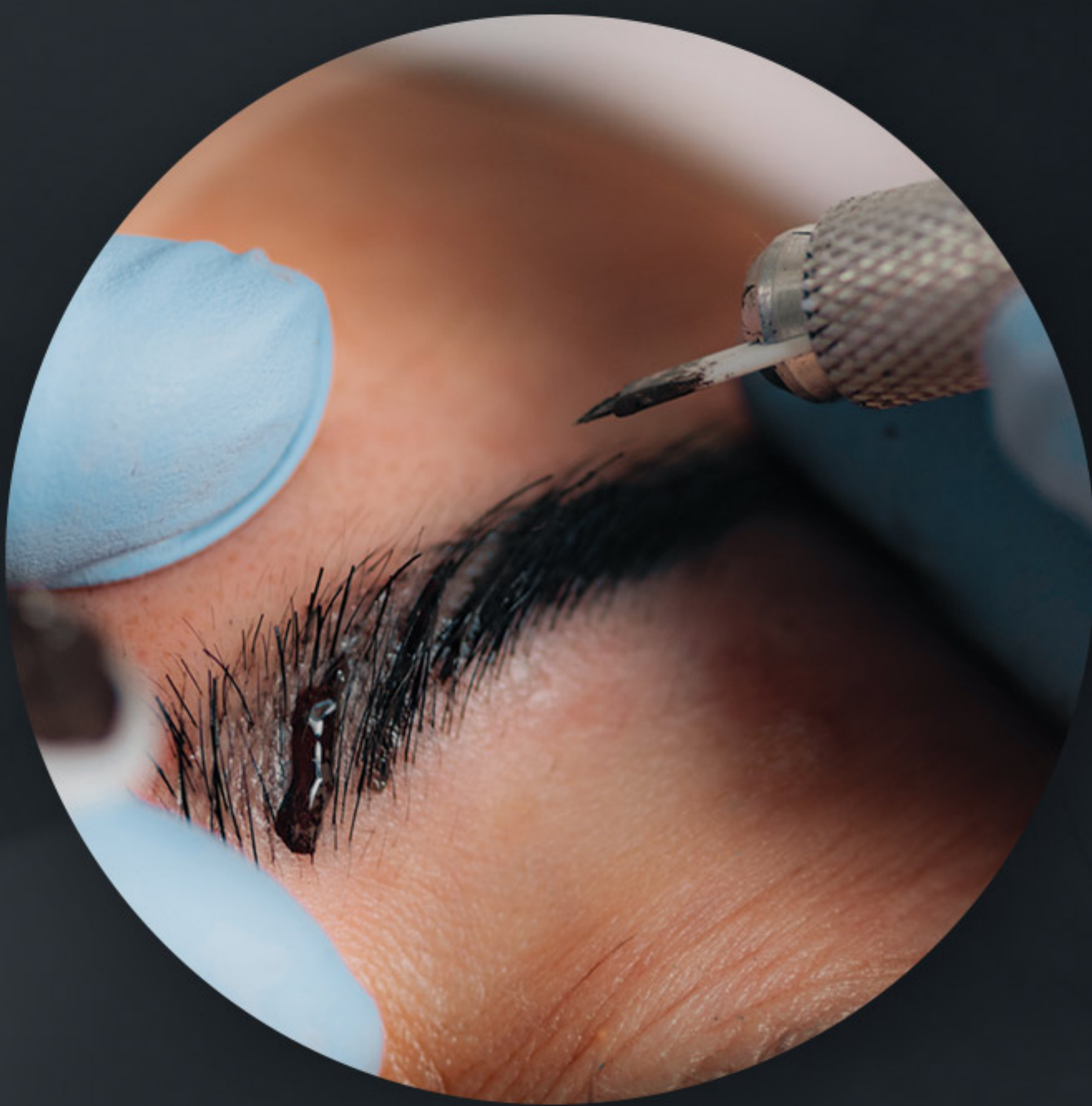
MICROBLADING AND SHADING