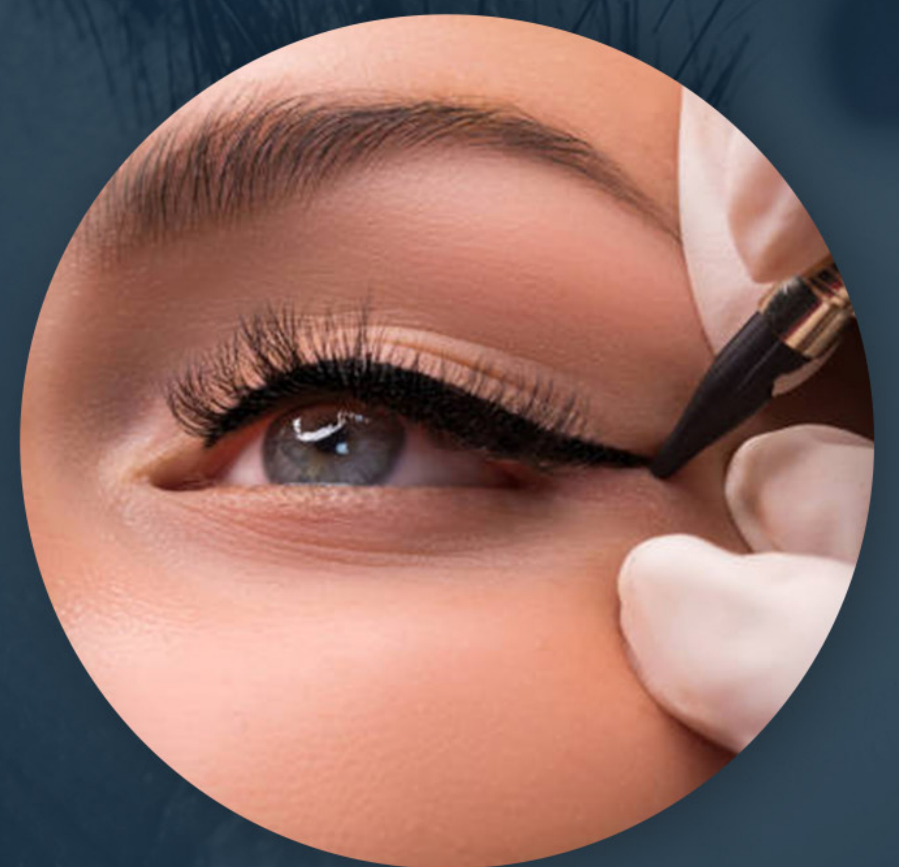
MODULAR COURSES TRAINING